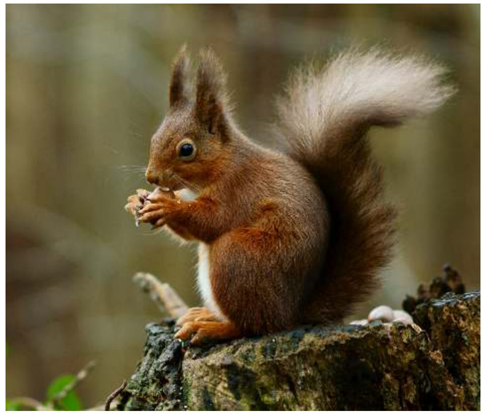
Published by St. Michael's Mansel Lacy Community Association With financial support from a Foxley Group Parish Council grant. Printed by Express Printing, Wellingborough