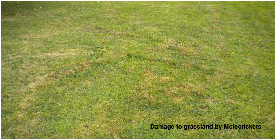
Damage to grassland by Molecrickets

Mole crickets have three life stages, eggs, nymphs, and adults. Most of their lives in these stages is spent underground, but adults have wings and disperse in the breeding season. They vary in their diet; some species are vegetarian, mainly feeding on roots; others are omnivores, including worms and grubs in their diet, while a few are largely predatory. Male mole crickets have an exceptionally loud song; they sing from a subsurface burrow that opens out into the air in the shape of an exponential horn. The song is an almost pure tone, modulated into chirps. It is used to attract females, either for mating, or for indicating favourable habitats for them to lay their eggs. In Zambia, mole crickets are thought to bring good fortune, while in Latin America, they are said to predict rain. In Florida, where Neoscapteriscus mole crickets are not native, they are considered pests, and various biological controls have been used. Gryllotalpa species have been used as food in West Java, Vietnam, and the Philippines. The above description is illustrated below as is the damage to a lawn. The damage it causes can also be seen (by appointment) at Yew Tree Cottage, Mansel Lacy. The solution to this menace is being actively pursued.