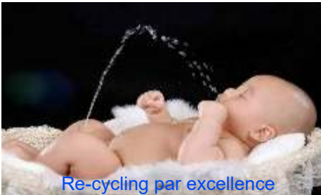
Re-cycling par excellence